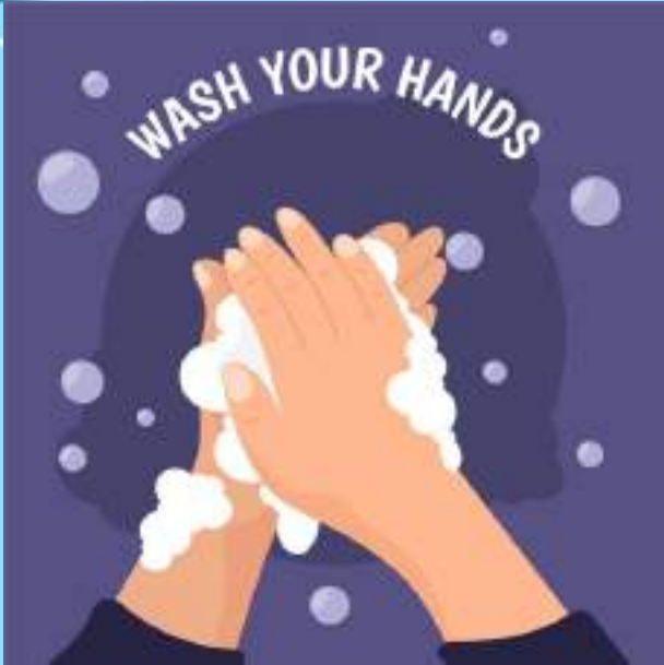
Wash your hands