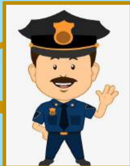
A police officer